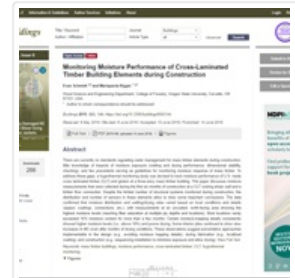
Monitoring Moisture Performance of Cross-Laminated Timber Building Elements during Construction