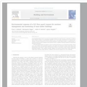
Environmental Response of a CLT Floor Panel: Lessons for Moisture ...