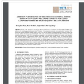
Adhesion Performance of Melamine-Urea-Formaldehyde Resins with Various Melamine Contents for ...