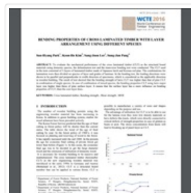
Bending Properties of Cross Laminated Timber with Layer Arrangement Using ...