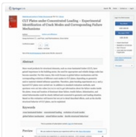
CLT Plates Under Concentrated Loading - Experimental Identification of Crack ...