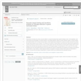
Acoustic Impact Testing and Waveform Analysis for Damage Detection in ...