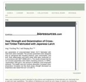
Block Shear Strength and Delamination of Cross-Laminated Timber Fabricated with ...