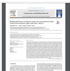
Bonding Performance of Adhesive Systems for Cross-Laminated Timber Treated with ...