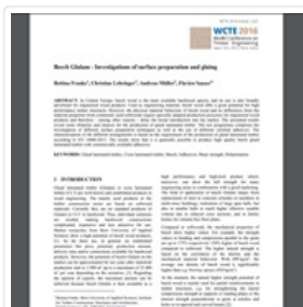
Beech Glulam - Investigations of Surface Preparation and Gluing