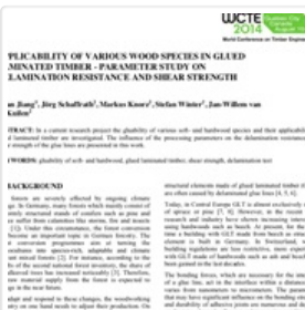
Applicability of Various Wood Species in Glued Laminated Timber - ...