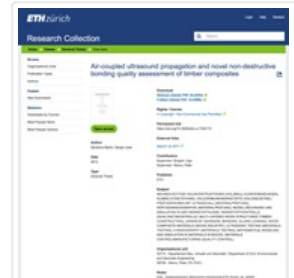
Air-Coupled Ultrasound Propagation and Novel Non-Destructive Bonding Quality Assessment of ...